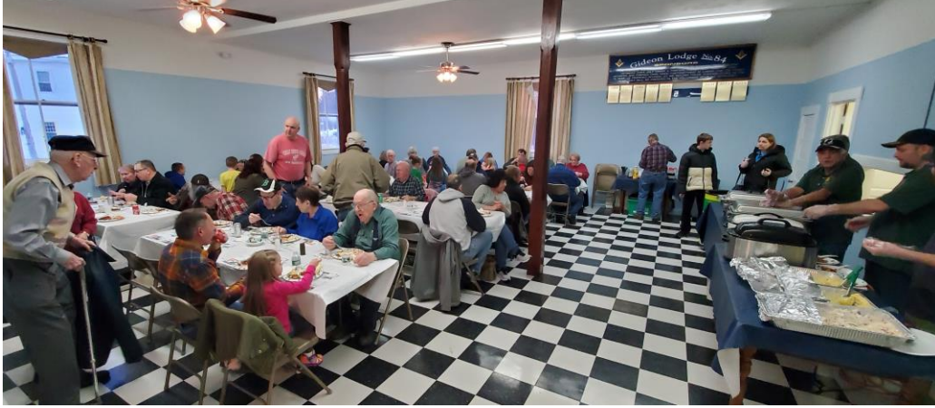
A Packed House at Our Last Ham & Bean Supper

Ritual Rehearsals held at the Lodge at 6pm every Monday are CURRENTLY CANCELLED